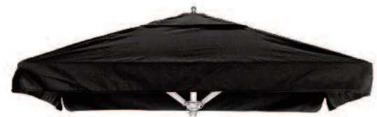
Coaster Full Venture with Umbrella Option