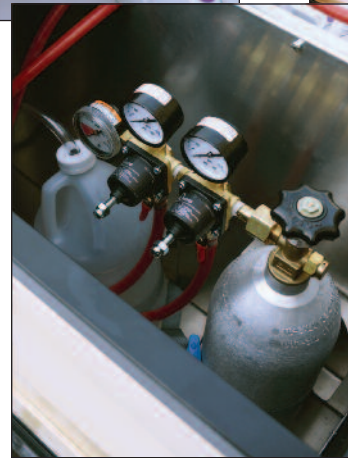
Complete Nitrogen Set Up with Tanks, Regulator and Hoses