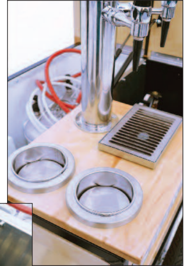
Twin Faucets with Drip Tray and Spring Loaded Cup Holders (Optional)