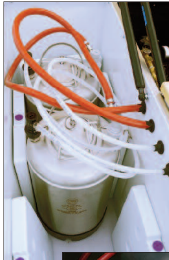
Plastic Lined Cargo Area Holds up to 9 Gallons of Coffee (3x3)