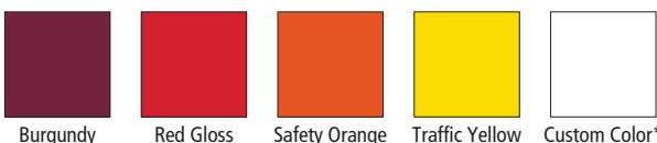
Burgundy Red Gloss Safety Orange Traffic Yellow Custom Color*