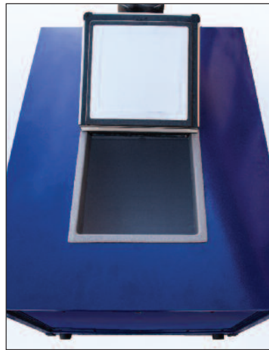
Twin Troy Hills Insulated Lid