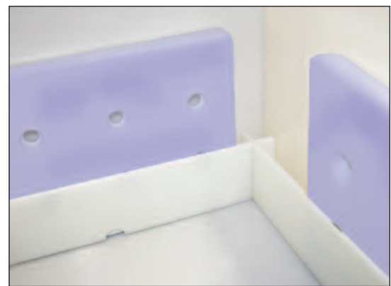
Plastic Lined Cargo Area with Cold Plate Retainers & Drain