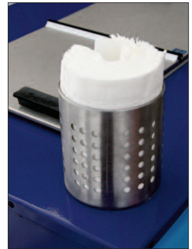
Magnetic Top Corners Hold Accessories