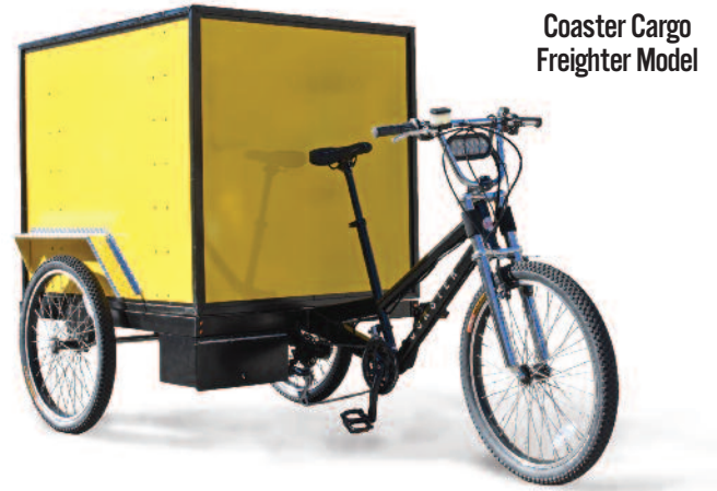
Coaster Cargo Freighter Model