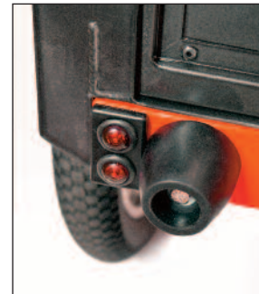
Vertical Storage Bumpers

The Cargo Mini measures 35" wide x 91" long and is available in a flatbed ( Mini Express ), pickup bed ( Mini Transit ), and vendor model ( Mini Venture ).