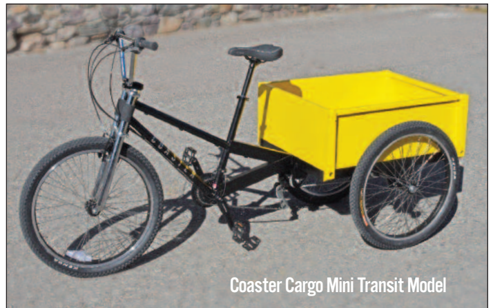
Coaster Cargo Mini Transit Model